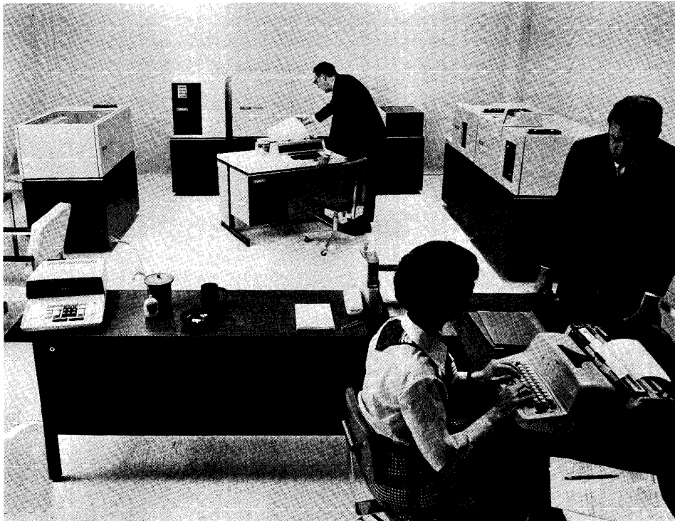
Designed to show how the compact System Ten components fit into a normal office environment, this photo shows (from left to right) a printer, magnetic tape drive, processor, disc drive, card punch, and card reader, all clustered around a Model 70 Workstation.

INSTRUCTIONS: Each instruction is 10 characters long, and the address of its leftmost character must be a multiple