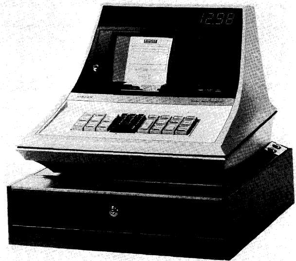
Singer's MDTs Data Terminal, the key component of the Modular Data Transaction System, is a "computerized cash register" that can be used effectively with the System Ten in either an on-line or off-line mode.

MODEL 7102 CONSOLE TYPEWRITER: Provides the System Ten operator with a means of communicating with the system. The 7102 is an adaptation of the widely used "Flexowriter" automatic typewriter; it consists of a conventional typewriter keyboard and printing mechanism plus an integrated paper tape reader and punch. The 7102 includes a special Console Input/Output Channel and is associated with a 1K Console Partition in main memory.