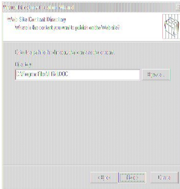
Figure 5-6: Entering the HTMLDOC Program Folder