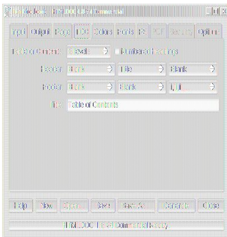
Figure 7-4 - The TOC Tab