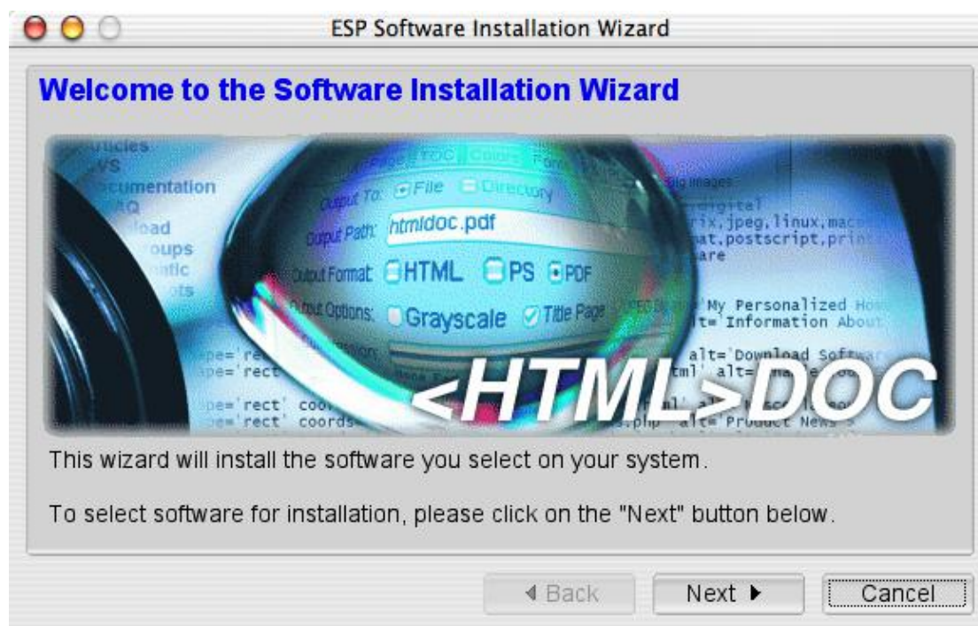
Figure 1-2: The software installation wizard

Double-click on the Install icon in the Finder window to start the software installation wizard (Figure 1-2) and follow the installer prompts.