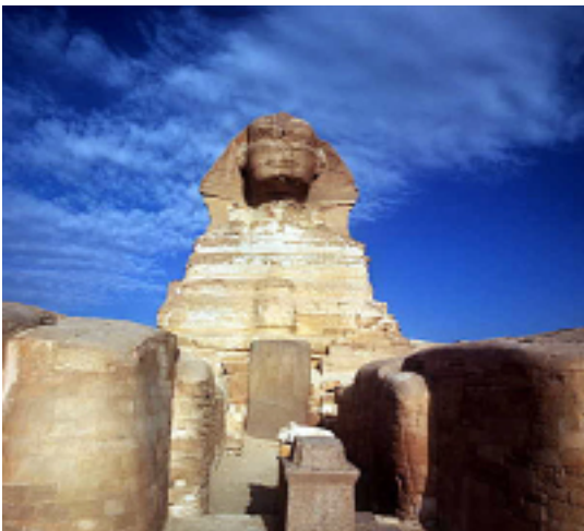
Fig. 9.1: My caption of the figure My description paragraph of the figure. Description paragraph is wraped with legend node.